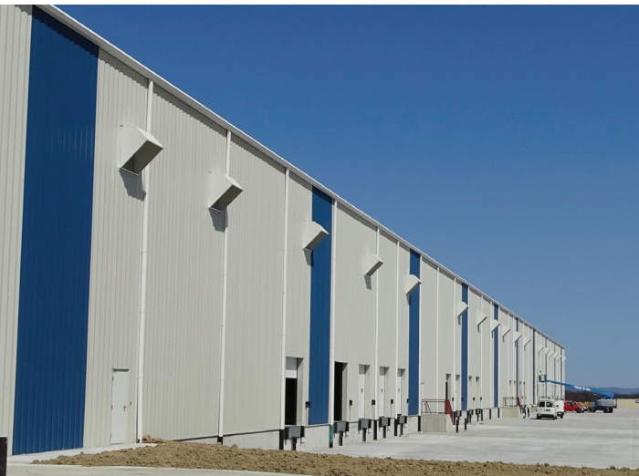
39 DOCK DOORS