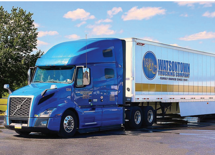
ON-DEMAND TRANSPORTATION CAPACITY THROUGH WATSONTOWN TRUCKING COMPANY